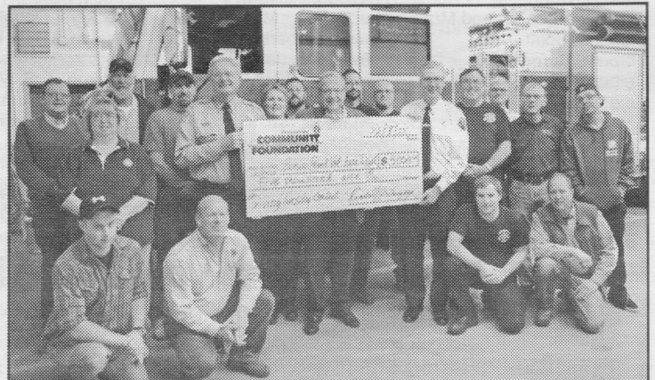
In December 2015, we participated in a contest thru The Community Foundation and won a donation which was applied to our recent purchase of the Lifepack 15.