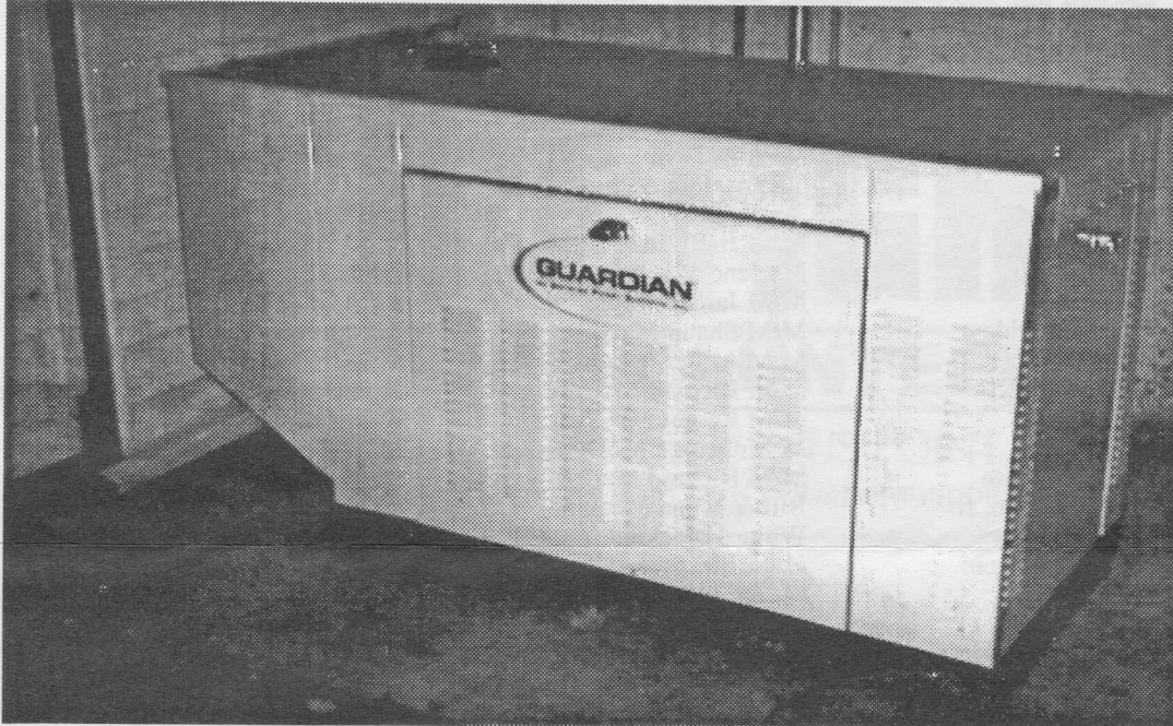
25K WATT NATURAL GAS GENERATOR