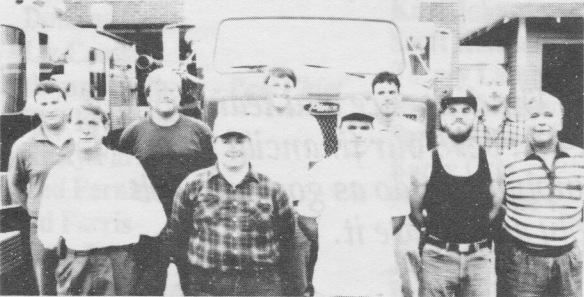
PICTURED FROM LEFT TO RIGHT:

These people are responsible for implementation on the scene of the general orders given by the fire chief. They manage teams of fire fighters/rescue personnel during an incident.