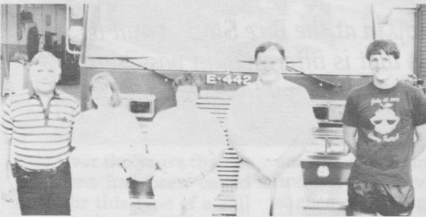
PICTURED FROM LEFT TO RIGHT:

The Overall Administration, Finances and fund raising responsibilities rests with these individuals.