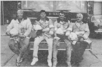
Pictured here, are the Fire Chief's. These are the guys that call the shots. The Ultimate responsibility of any call or function of the Fire Department rests on their shoulders